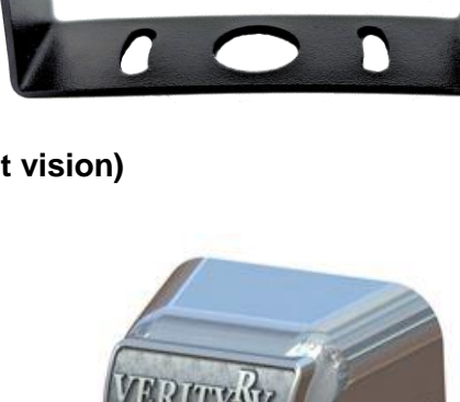
Optional ADD100Z Camera Cover